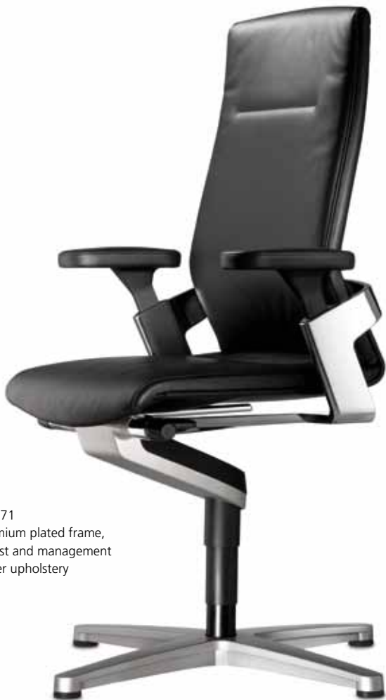
Model 175/71 Bright chromium plated frame, with headrest and management grade leather upholstery