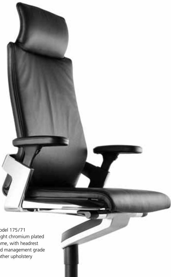
Model 175/71 Bright chromium plated frame, with headrest and management grade leather upholstery