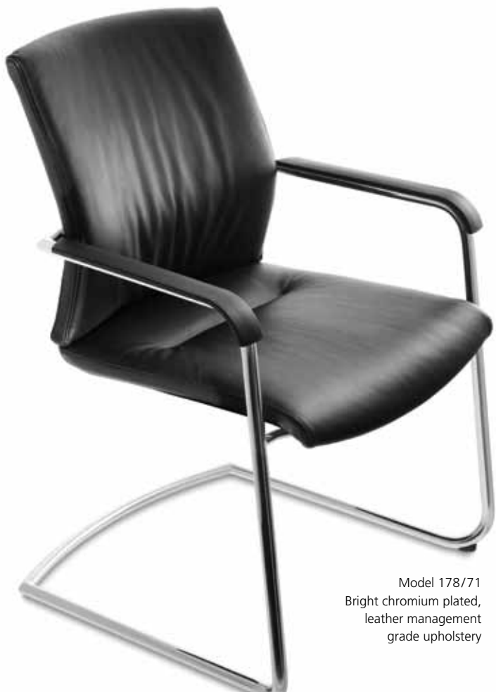
Model 178/71 Bright chromium plated, leather management grade upholstery