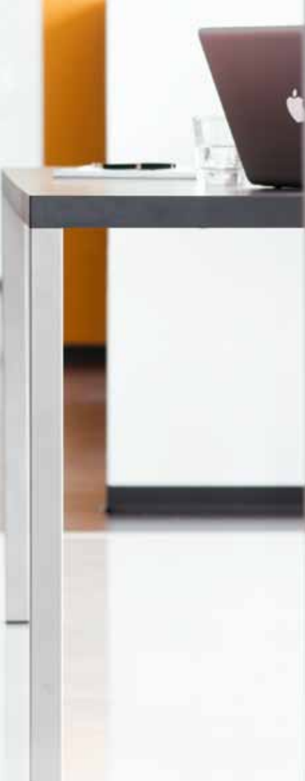
Model 178/7 Bright chromium plated, stackable, with fabric cover