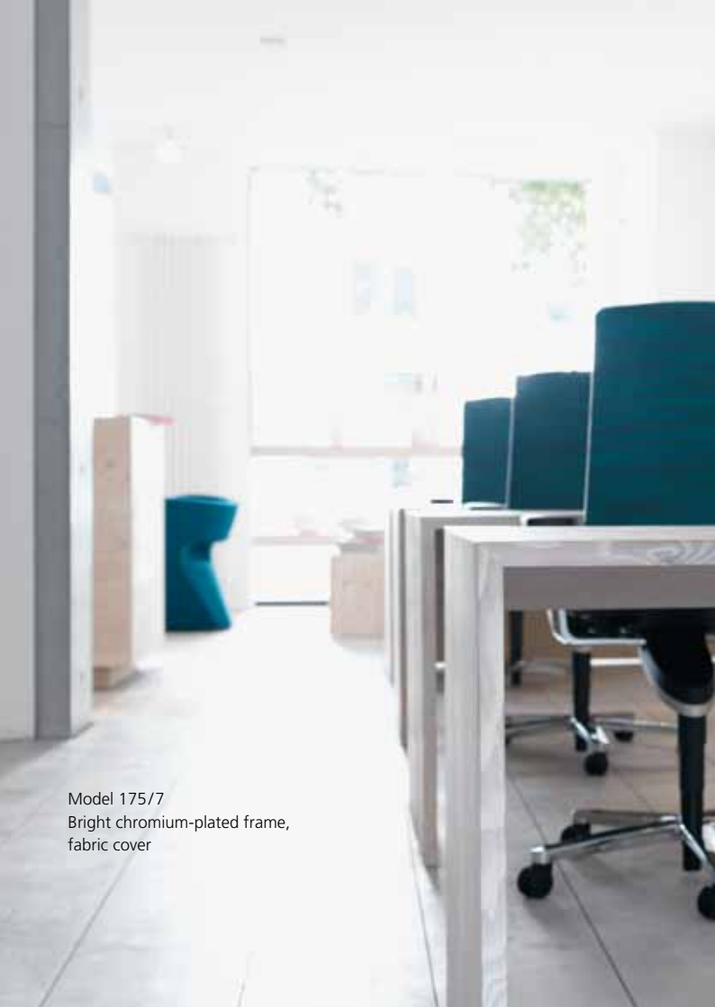
Model 175/7 Bright chromium-plated frame, fabric cover