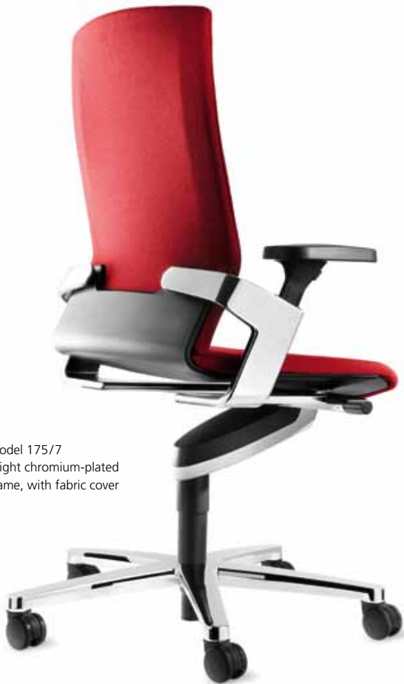
Model 175/7 Bright chromium-plated frame, with fabric cover