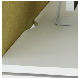
Desktops with a scallop for wire management