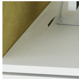
Desktops with a cut-out for grommet and wire management